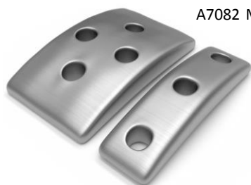
A7082 Malhotra Platinum Segment® 0.4g 6.00mm x 4.00mm x 1.00mm

The Malhotra Platinum Segments® have been developed with Raman Malhotra FRCOphth in order to provide gravity-assisted treatment for lagophthalmos. The sutured format also allows the chain to be flexible and mold to the contour of the patient's eye. The surgeon selects the quantity and sizes of weight to be used for each individual patient. The weights are made from an alloy of Platinum and Iridium and are available from Altomed Limited (sales@altomed.com). Weights can be removed or added by the Surgeon if deemed necessary.